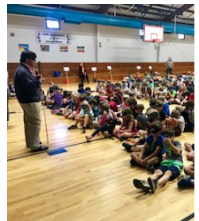
Lyons Elementary, Lyons Colorado